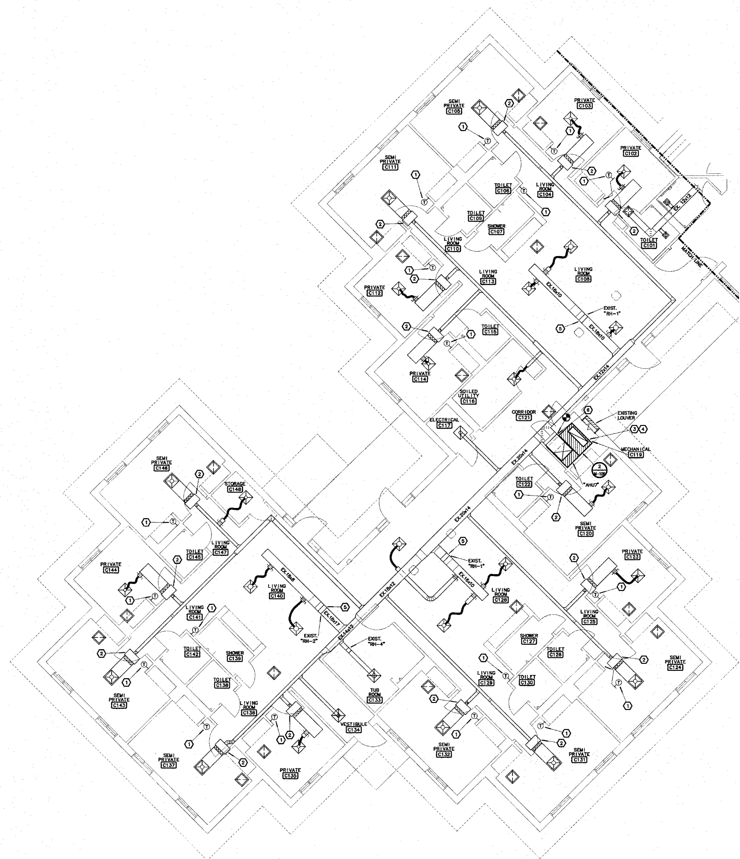
1 WING 'C' - MECHANICAL IMPROVMENT PLAN M-108 SCALE: 1/8"=1'-0" NORTH