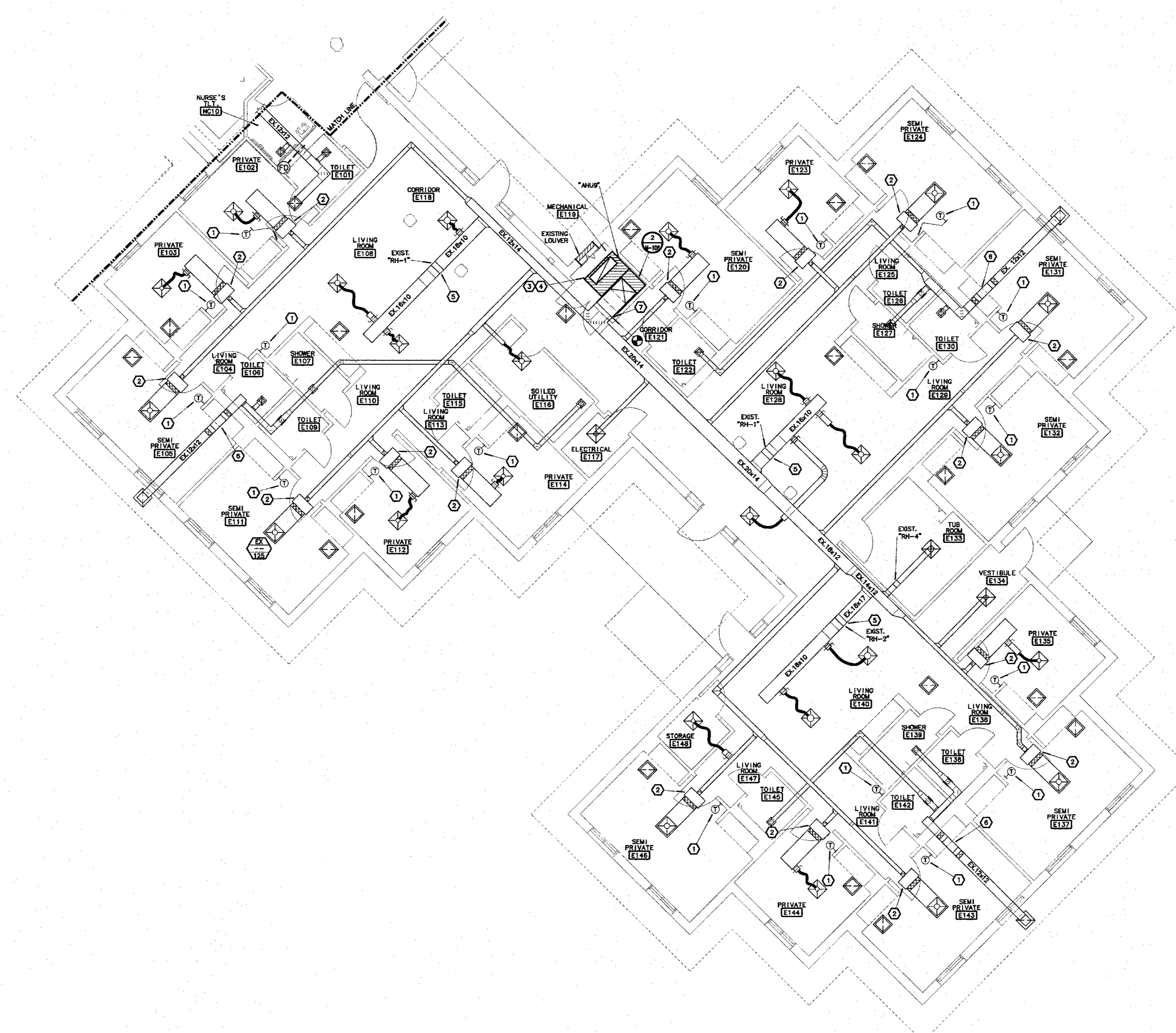
1 WING 'E' - MECHANICAL IMPROVEMENT PLAN M-110 SCALE: 1/8"=1'-0" NORTH