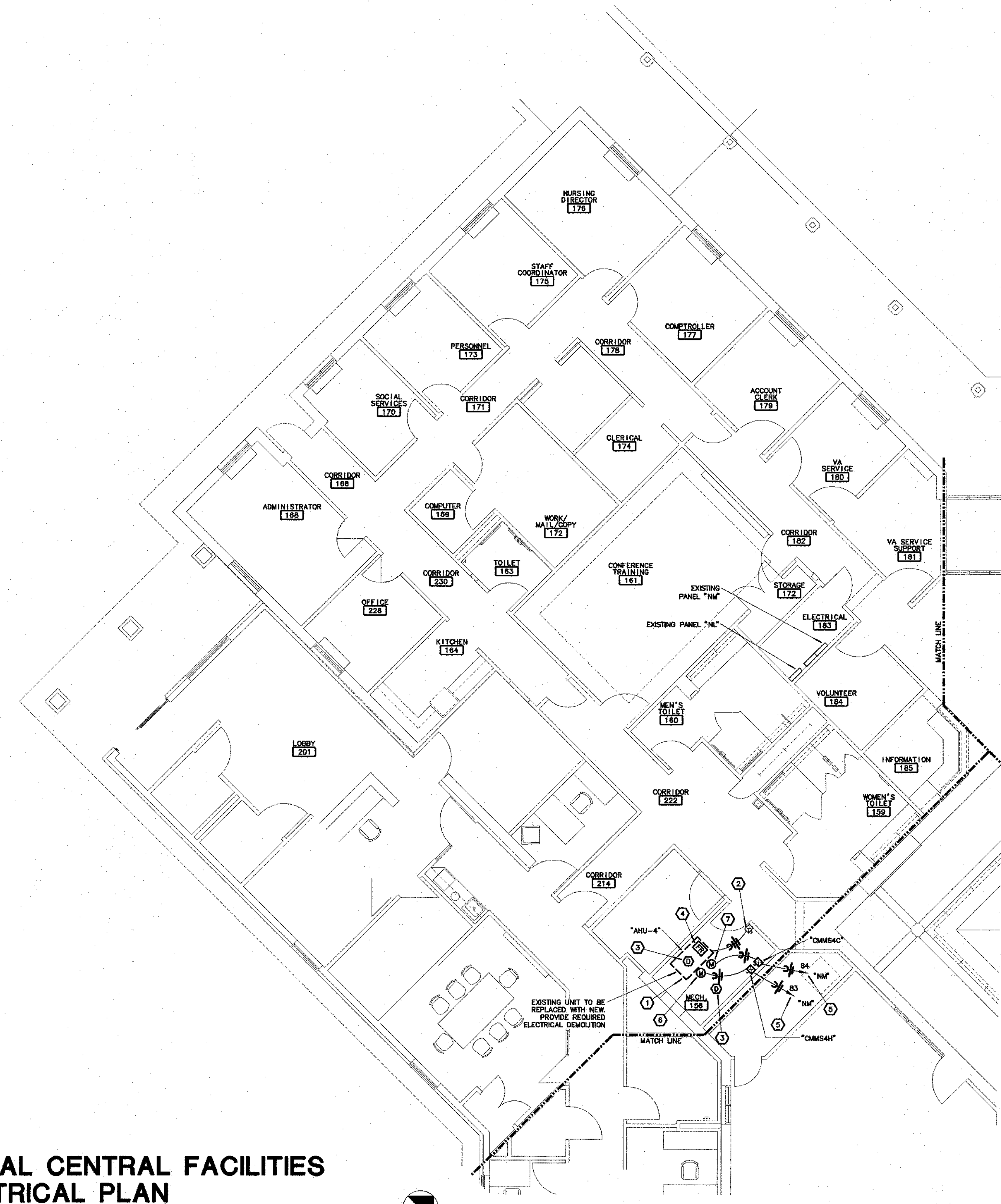
1 E-102 PARTIAL CENTRAL FACILITIES ELECTRICAL PLAN SCALE: 1/8"=1'-0" NORTH