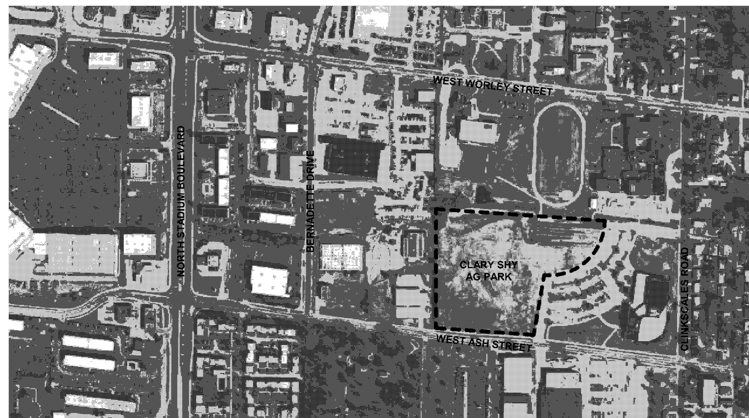
01 LOCATION MAP G0.01 1" = 300'-0"

2801 Woodard Drive, Suite 105 Columbia, MO 65202 phone: 573.874.9455 fax: 573.999.3840